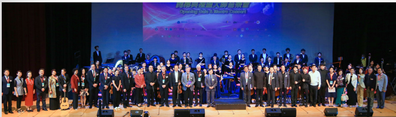
▲ The 10th Hong Kong International Music Festival 2023 the Opening Ceremony and Masters' Concert.