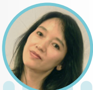
Tang Pin Fei