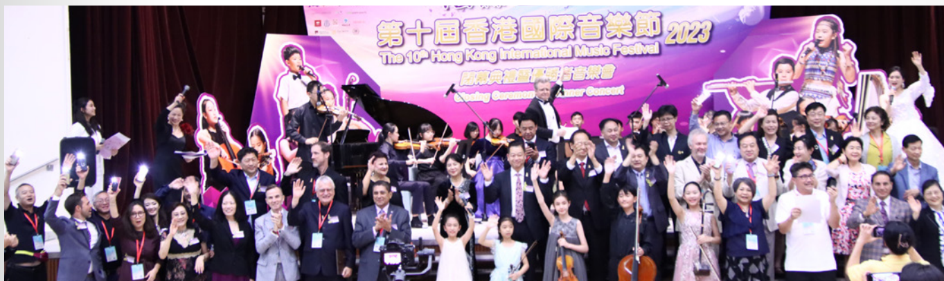
▲ Jurors and Guests of the 10th Hong Kong International Music Festival 2023 during the Closing Ceremony and Winners' Concert.