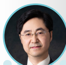
Yang Yan di